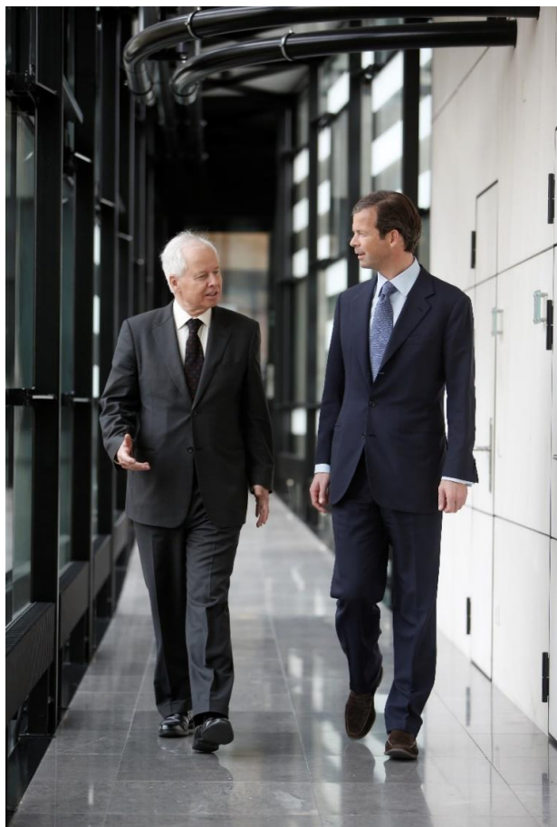
H.S.H. Prince Philipp von und zu Liechtenstein (left) H.S.H. Prince Max von und zu Liechtenstein (right)

“LGT’s family ownership and governance allow for efficient decision-making in the context of a long-term strategy.”